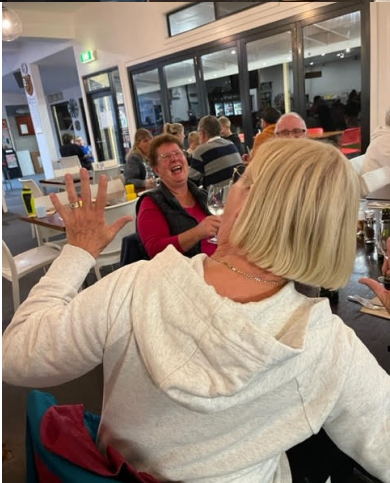
Something tickled their fancy, maybe she was describing how big it was!