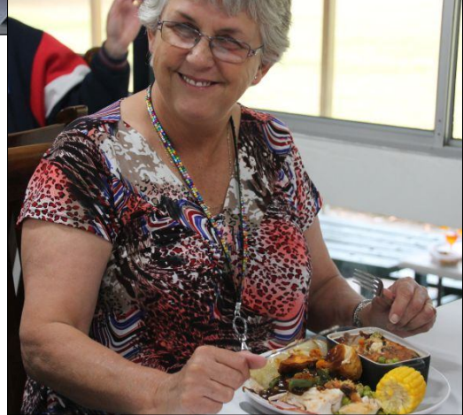
More photos from the Christmas Rally