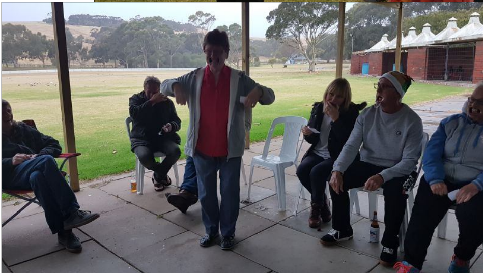
A selection of photos from the Christmas Rally